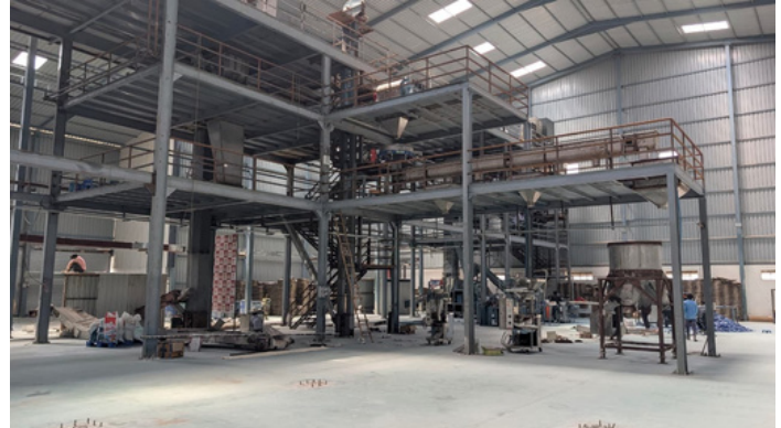
Powder Line 1 & Line 2 — FFS Packing Multi-level Automated Structure & Multi-stage Dosing