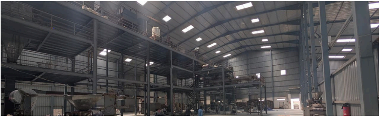
Factory Floor -Multi-Level Automated Plant Structure