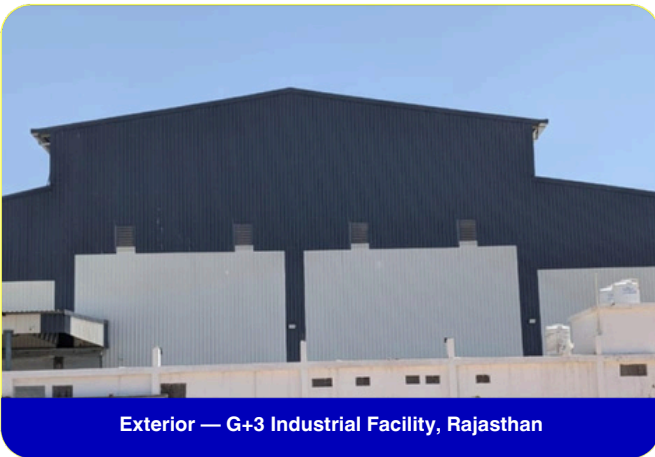
Exterior — G+3 Industrial Facility, Rajasthan