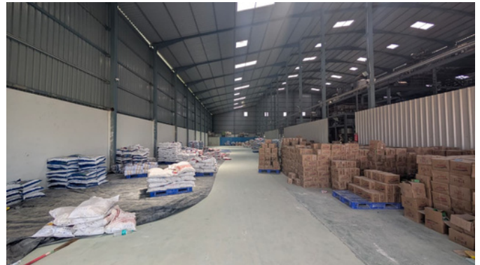
Finished Goods Floor View