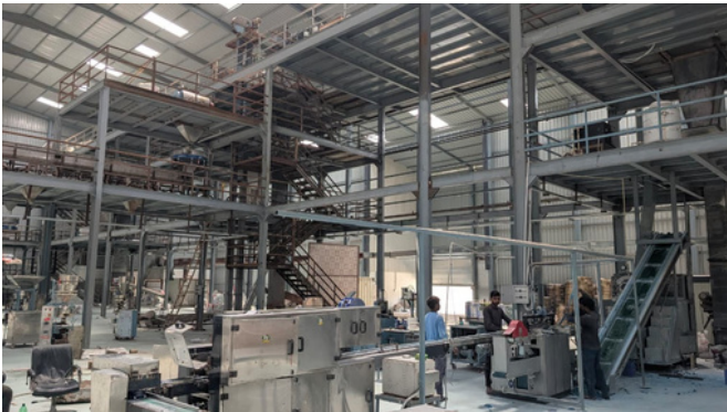
Detergent Cake Line- Production floor view

CAPACITY: 36 MTPD | 1.5 MT/hour ● OPERATIONAL Square & Round Variants · Sigma Mixer (1.2MT) · Duplex Vacuum Plodder (6") · Auto Stamper · Servo Flow Wrap (200 UPM)